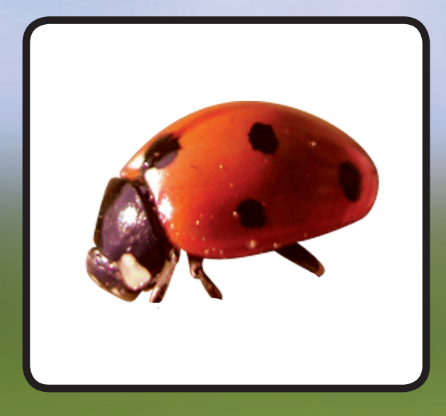
California's Unlikely Warriors