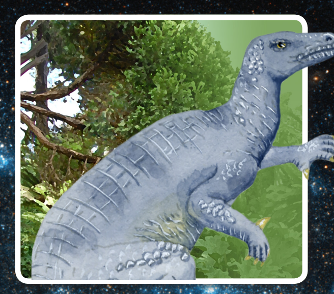
The Lost World